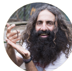
Costa Georgiadis Host, Gardening Australia, ABC